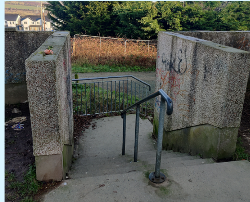
Figure 2 - Existing steps