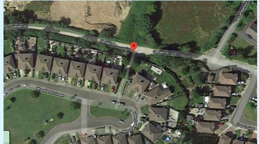
Figure 1 - Project Location Map